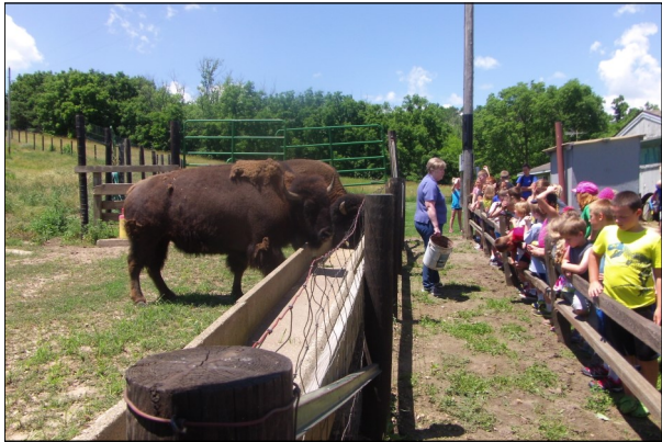
You may visit the buffalo year-round at the Cody Homestead.